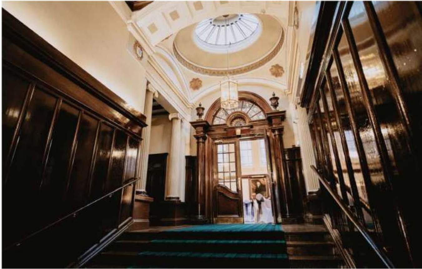
The buildings of the Royal College of Physicians and