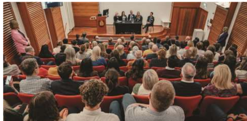
Maurice Bloch Lecture Theatre