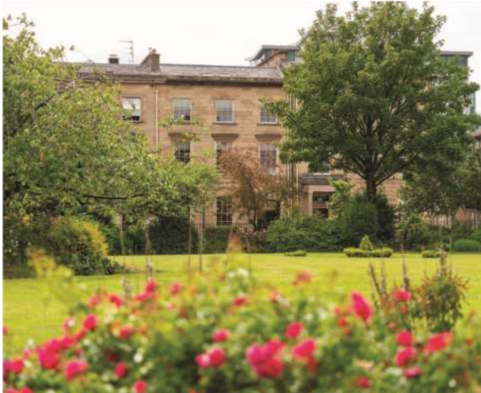
19 Blythswood Square